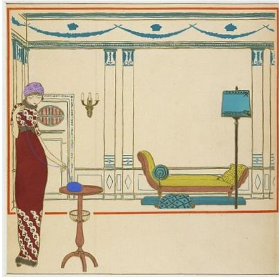
Fig. 2. Georges Lepape. “Design for a high-waisted dark red dress”. In Les Choses de Paul Poiret vues par Georges Lepape . April 1911. Callotype, letterpress, line block and stencil. Victoria and Albert Museum, London.