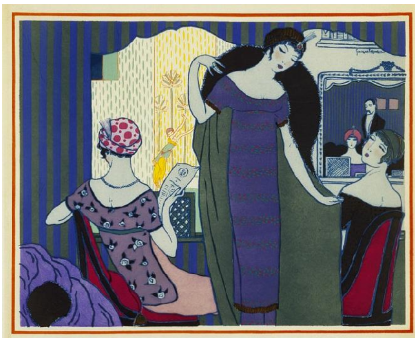
Fig. 3. Georges Lepape. “Trois robes neuves”. In Les Choses de Paul Poiret vues par Georges Lepape . April 1911. Callotype, letterpress, line block and stencil. Victoria and Albert Museum, London.