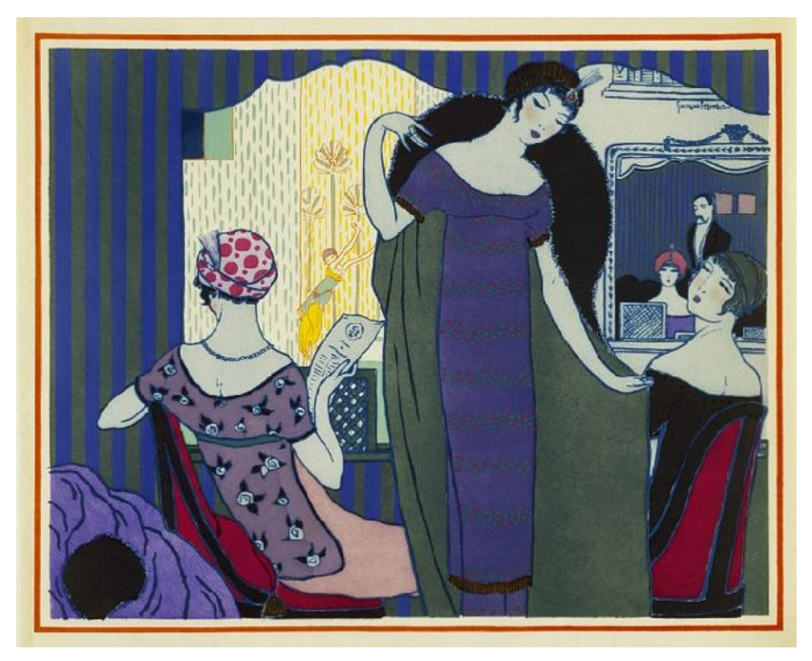
Fig. 3. Georges Lepape. "Trois robes neuves". In Les Choses de Paul Poiret vues par Georges Lepape. April 1911. Callotype, letterpress, line block and stencil. Victoria and Albert Museum. London.