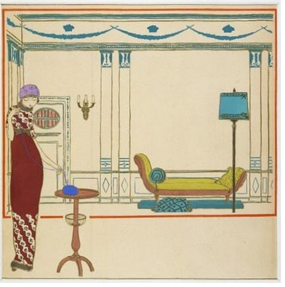
Fig. 2. Georges Lepape. "Design for a high-waisted dark red dress". In Les Choses de Paul Poiret vues par Georges Lepape . April 1911. Callotype, letterpress, line block and stencil. Victoria and Albert Museum. London.